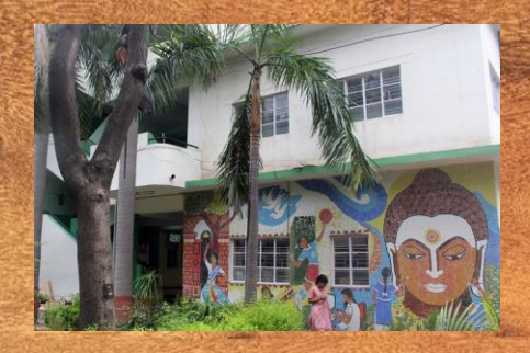
Salwan Girls Sr.Sec. School Rajendra Nagar (1950)