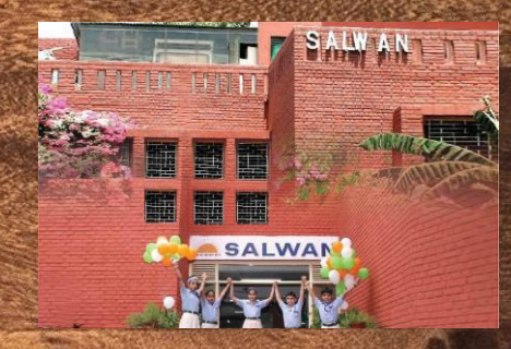
Salwan Junior School Naraina(1993)