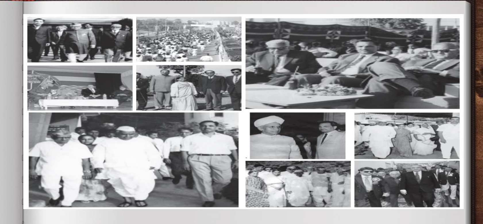
A Visionary among Leaders