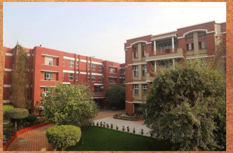
Salwan Public School Sector -15(II), Gurugram (1996)