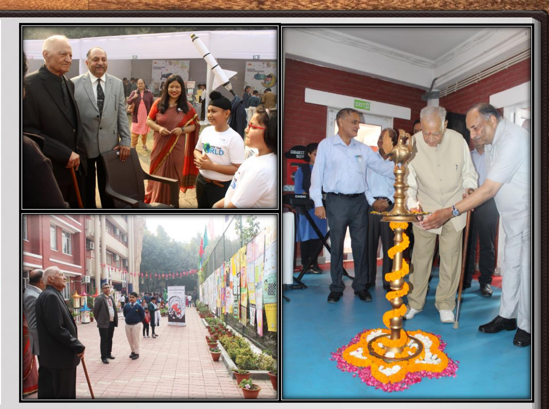
Inspiring Minds, Creating Change