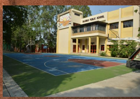
Salwan Public School Trans-Delhi Signature City, Ghaziabad (2005)