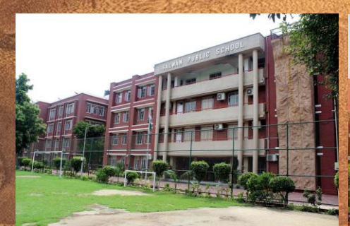
Salwan Public School Mayur Vihar, Phase-III (1996)