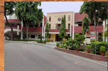
Salwan Public School Rajendra Nagar (1953)